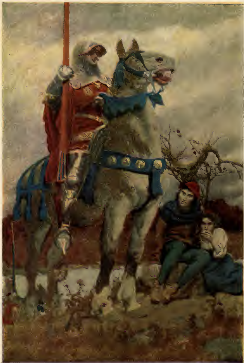
HENRY OF LANCASTER WHO IN 1399 AS HENRY IV BECAME ENGLAND'S KING IN THE STEAD OF THE WEAK, WICKED, AND TREACHEROUS RICHARD II